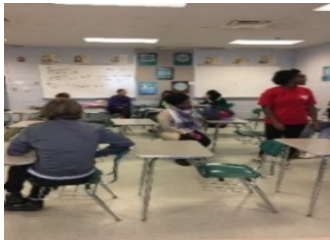
Students at Lake Carmorant High School