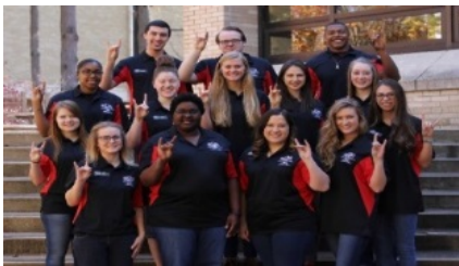
College of Education & Behavioral Science 2017 Ambassadors