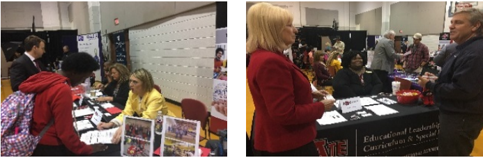
Scenes from Beebe Transfer Fair, March 7

Finding the right college or job is very challenging in today's society. However, this challenge did not stop students from Jonesboro High School, Hoxie High School and Lake Cormorant High School to visit with staff and college ambassadors. Students from grades 9 th -12 th visited with representatives and shared their interests in some of the programs offered such as teacher education, psychology, sport management, and physical education.