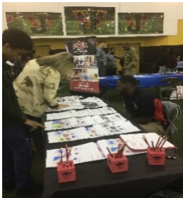
Jonesboro High School